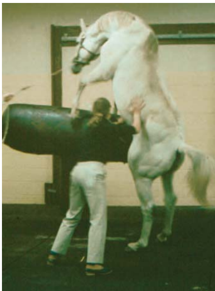
Fig. 8. Standing up on a dummy mount as commonly seen with carpal rubs.

novices even for natural cover and therefore may not be due only to suboptimal conditions of the dummy mount and semen collection. In such cases, when using a dummy, in addition to attempting to maximize the stimulation of the AV, we find it useful to try to evaluate the best combination of dummy height, position of the grasping leathers, and position of “hips” built into the sheepskin cover. We record the positions (Fig. 7) and evaluate video records to “tweak” positions for the best combination. In almost all cases, raising the dummy to somewhat higher than a live mare of the same size can help stallions “lock in” and thrust in a more organized manner.