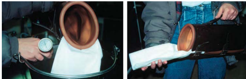
Fig. 6. Soft cotton toweling attached to a Missouri style AV dipped into hot water for application of additional thermal/manual stimulation at the base of the penis to encourage thrusting.

lion “tends” the mare, remaining nearby to protect her from harassment by other stallions. So, for stallions that are reluctant to leave, we just wait a minute or two, remove the stimulus mare from the breeding shed, and then encourage the stallion to leave without a battle. Occasionally, we have a stallion that does much better if allowed to follow the stimulus mare back to his stall. We usually decide to abide that rather than to battle with the stallion. Many people establish a routine of pasture turn-out immediately after breeding, or, in hot weather, a cool bath. These can be great positive reinforcements for a good job and for leaving the breeding area. Reluctance to leave the breeding area typically wanes with experience with the routine. Occasionally, we find a stallion that retains this tendency through a long breeding career.