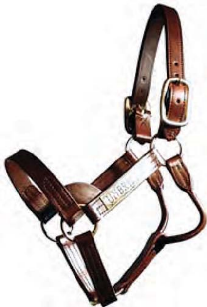
Fig. 1. Example of a stallion breeding halter.

For training, we tend to use a fairly warm (47° to 50° C lumen) and full AV with ample lubrication to provide the most inviting stimulation for the particular stallion. We also have hot compresses, as shown in Figure 6, ready to apply to the base of the penis for added encouragement to thrust. Once trained, a more average AV temperature and pressure are likely to suffice for most stallions. Many stallions that have difficulty responding adequately with a disposable plastic AV liner will have much less difficulty with the unlined latex liner. We do not routinely use a disposable liner system when training stallions.