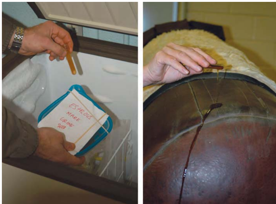
Fig. 4. Estrous mare urine, from a variety of mares, stored frozen for application as needed to improve response to the dummy mount.