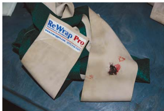
Fig. 5. Breeding leg wraps made of rubber-coated stretch fabric that enable a non-roll, snug fit to protect from carpal rubs as the stallion grasps the mount.

Our first goal when entering the breeding shed is to have the stallion enter the area and to become oriented to the stimulus mare from a distance of 20 to 30 feet initially, while abiding direction from the handler. Probably half of novice breeders will achieve and maintain an erection for preparation of