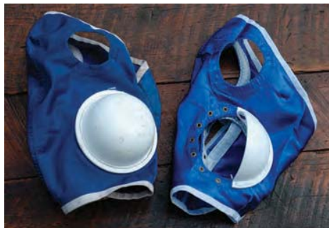
Fig. 3. Full-cup blinder and half-cup blinder hoods.

When preparing to work with a novice, we also have a few additional items handy, should we wish to try them. These include: