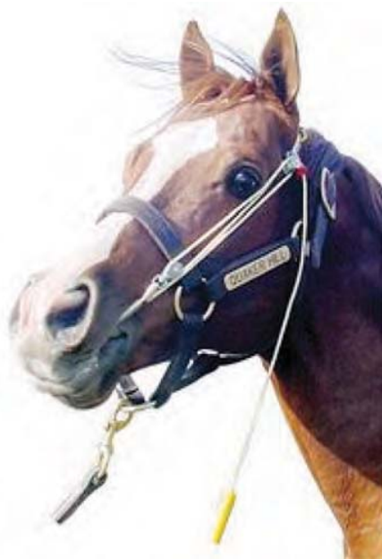
Fig. 2. Restraining device rigged to apply steady pressure to the gum.

become conditioned to such injudicious action, jerking the chain on the tongue or nose may insight dangerous evasive or offensive behavior, especially striking, rearing, or even boxing while rearing as if fighting the handler or the restraint. Some stallions can get used to being jerked around or to the nervous jerking on a chain shank, and some not only tolerate injudicious shanking but appear to become conditioned to it as a predictor of breeding opportunity. Alternatively, it can lead to “learned helplessness,” known to horseman as “souring” or “sulking,” which is counterproductive. Other configurations of the chain under the chin or completely around the nose or diagonally over the nose or under the chin can also be used effectively.