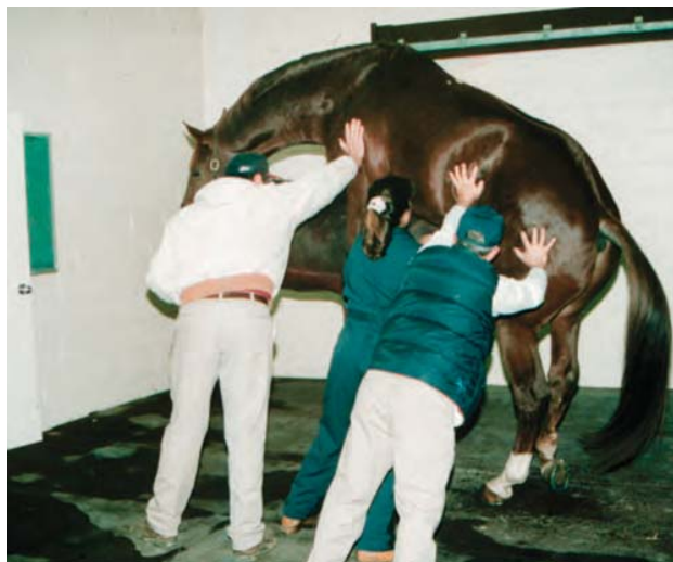
Fig. 9. Use of a “spotter” at the hip to guide the stallion to remain “squared up” at the rear of the dummy mount.

Another common difficulty with semen collection is the stallion advancing up the side of the dummy mount. Whether or not thrusting in an organized manner and achieving ejaculation, a stallion may paddle or scramble with the forelimbs or sometimes rotate such that both forelegs are over the dummy mount. This can be the case with a live mount mare as well and is not always attributable to dummy fit. With the dummy mount, adjustments can often be made that cannot be made with a live-mount mare. Changes we find helpful in keeping the stallion squared up at the rear of the mount include (1) guiding the stallion’s head to rest to the near side of the dummy, (2) increasing the height of